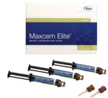
©2009 Kerr Corporation Lit. No. 34081 Rev. 2 All trademarks are property of their respective owners.